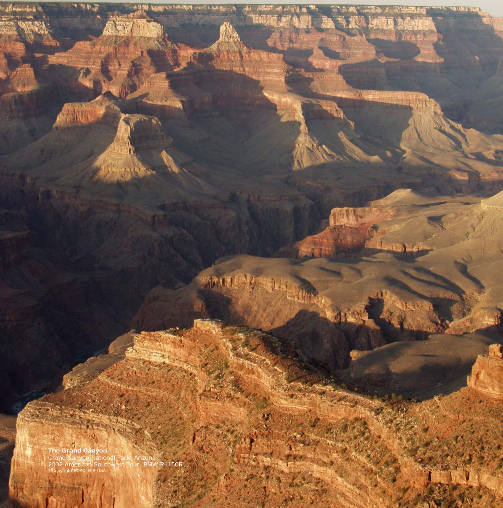
The Grand Canyon Grand Canyon National Park, Arizona 2002 American Southwest Tour, BMW R1150R